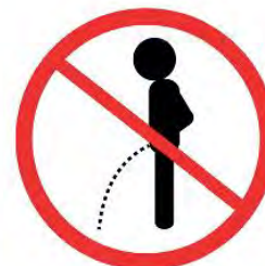
Do Not Urinate