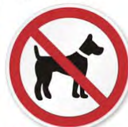
No Pets on Dock Or on Boat