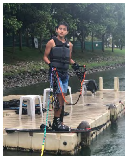
skier ready to go